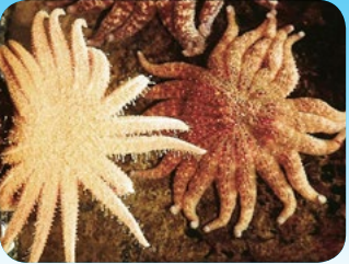
Sunflower sea star