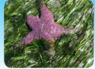
Purple sea star