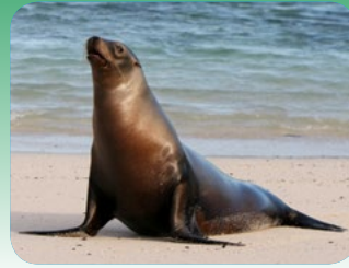
California sea lion