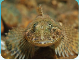
Tide pool sculpin