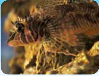
Tide pool sculpin

Nooca yar oo kallunka kamid ah badda saalkeeda ka qarabata