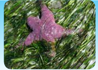
Purple sea star