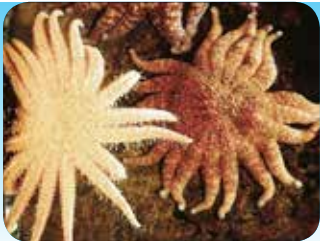
Sunflower sea star