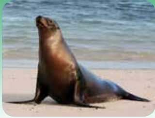
California sea lion